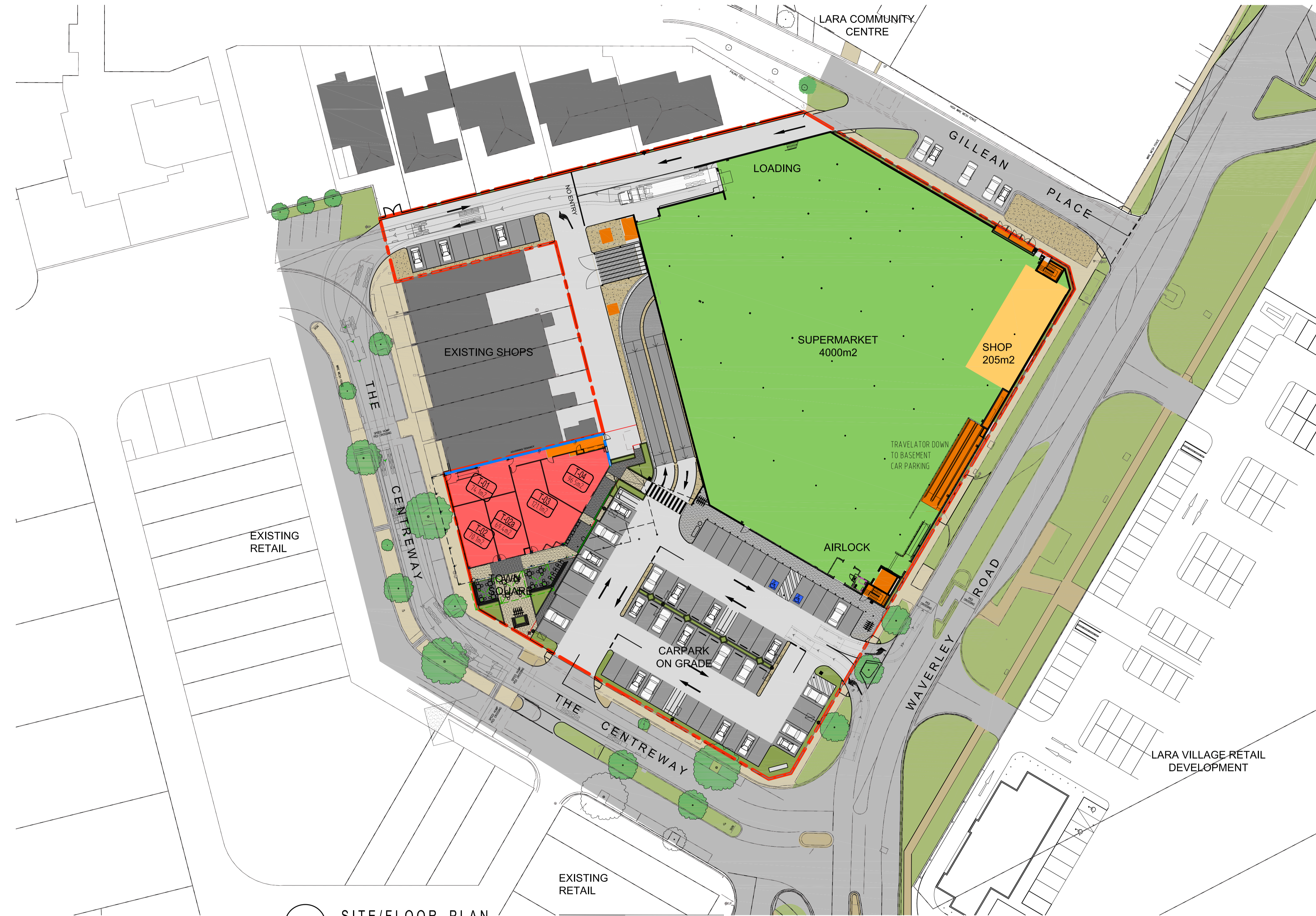
SITE/FLOOR PLAN PROPOSED GROUND LEVEL FLOOR PLAN 1:400